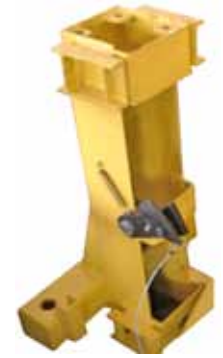
Heavy-Duty Lock System & Carriage