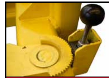
Lock Release Gears