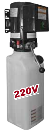
2.5 HP Power Unit