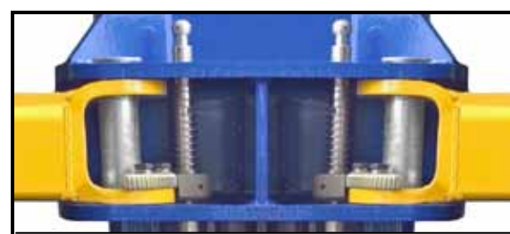
Automatic Arm Release

EXTENDED PROTECTION PLAN: Ask About Our Extended Protection Plan!