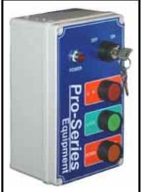
Push Button Controls w/ Key Security